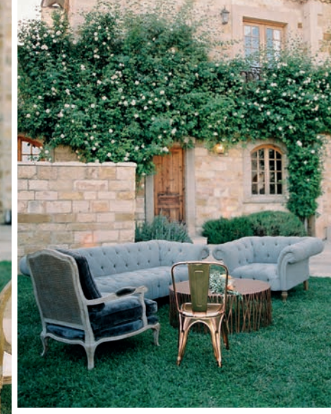
The reception took place outside the winery's limestone villa; Guests lingered over a wine-paired four-course Mediterranean feast