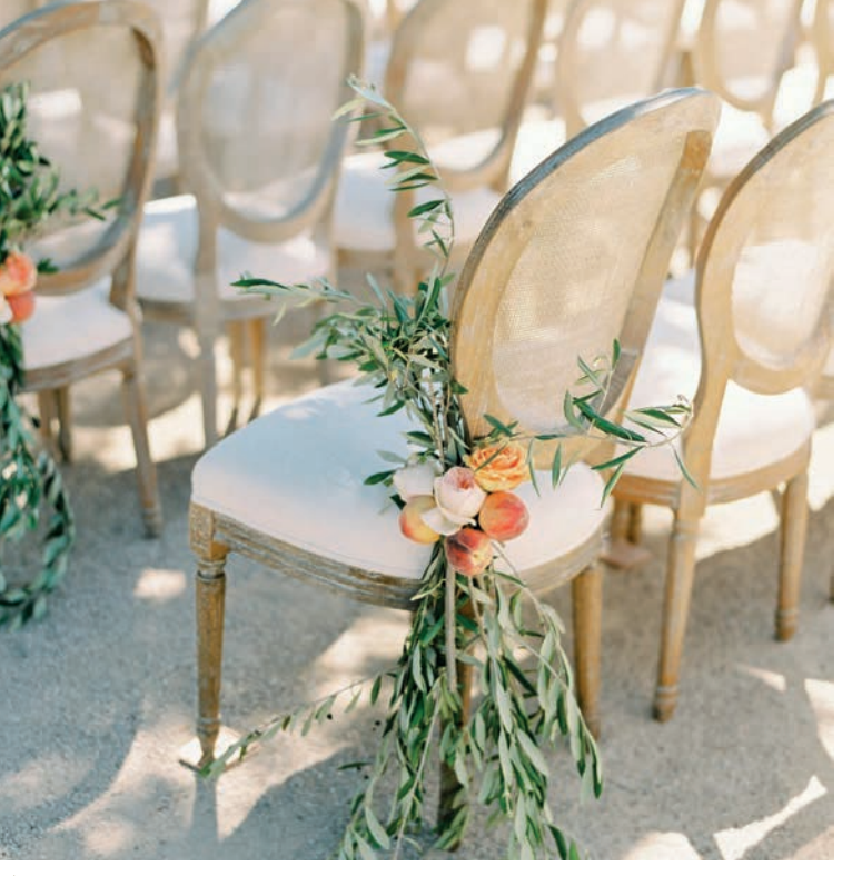
The event had an Italian ambiance thanks in large part to the Tuscan-inspired Sunstone Winery setting. The ceremony area was nestled amid the vines under a four-poster pergola accented with billowy fabric and a wine barrel.